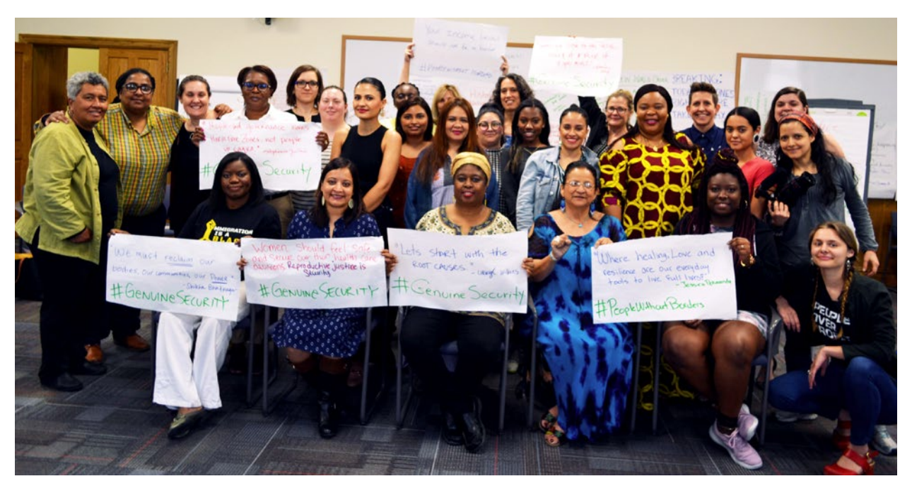
Activists, practitioners and academics at the Peace and Social Change workshop.