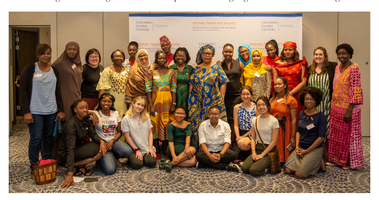
Peace and Social Change Fellowship participants with WPS program staff at workshop in Nairobi.

The Barali Foundation was created to address disparities in sexual and reproductive health and rights in Lesotho's rural populations. They work to engage their community in dialogue around LGBTQ+ rights and abortion rights. Their work also includes addressing issues of domestic violence and child marriage, and facilitating skills-building and financial independence through agriculture for women and girls.